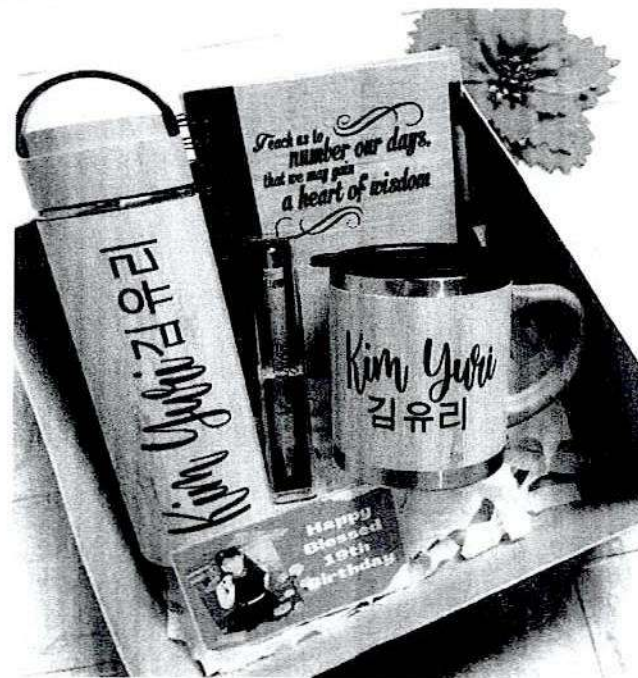
Personalized Bamboo Premium Gift Set(Tumbler,mug,notebook,pen) w/ NFC Logo