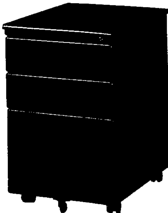
Cabinet with 3 drawers