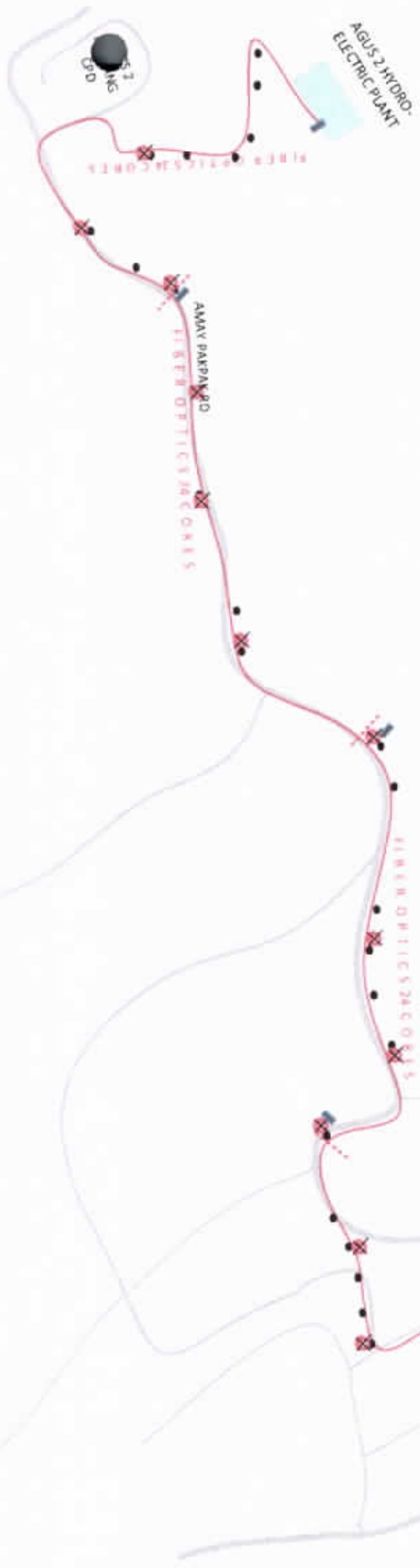
PROPOSED NPC - AGUS 1 TO AGUS 2 FIBER OPTIC BACKBONE ROUTE